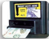
MDB protocol ready