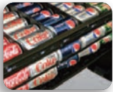
High Capacity Tray